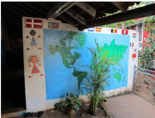
world map on the Veranda wall