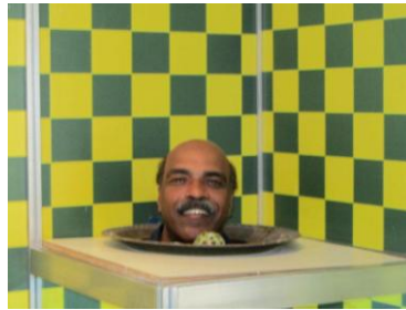
Pastor Prince on a plate!