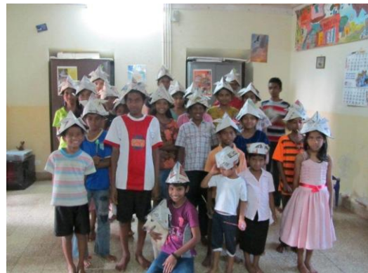
enjoying origami Samurai hats including Whitey the dog

Because of the Diwali holiday break they were able to spend sometime everyday catching up with the children; teaching them some origami; meeting new children; exchanging jokes; visiting the local Science Centre ( similar to our Science Museum ) and visiting Mirimar beach to do all the things people do all over the world when at the seaside – cricket, sandcastles and paddling!