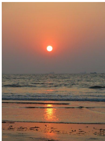
Sunset at Mirimar Beach