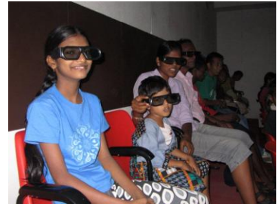
3-D glasses to watch Dinosaur film